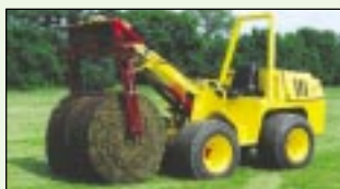
Bucyrus Magnum 136A