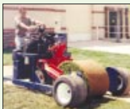
Brouwer SPI 2430