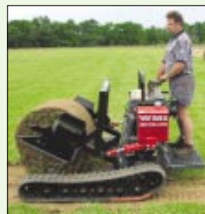
WMI Big Roll Installer