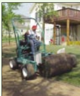
Miller's Turf Super 2000