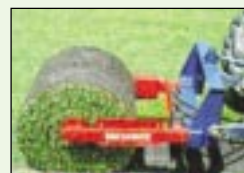
Brouwer SIH 2400